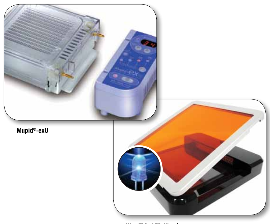
UltraThin LED Illuminator